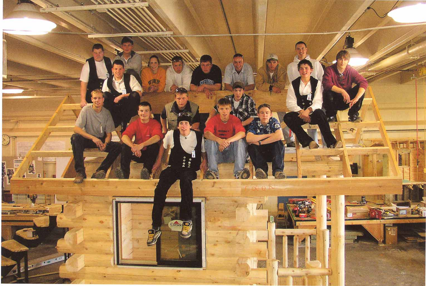
Exchange students from Germany and NTC students in the Residential Building Systems program worked together to build a log house. Besides providing an educational experience, the log house was used in auction to raise money for 12 NTC students to continue the exchange in Germany next spring.